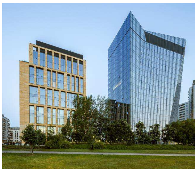
Gdański Business Center I is one of only five Warsaw investments who hold the 'Excellent' rating in the BREEAM Final certification."

Gdański Business Center I is a modern Grade A office complex developed by HB Reavis in the Warsaw district of Muranów. It consists of two office buildings with a total area of nearly 48,000 sq m. The investment is powered exclusively with renewable energy and offers