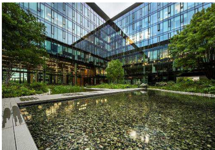
Zdrofit Fitness Club and Bilans, a consulting and accounting firm will soon move into Konstruktorska Business Center