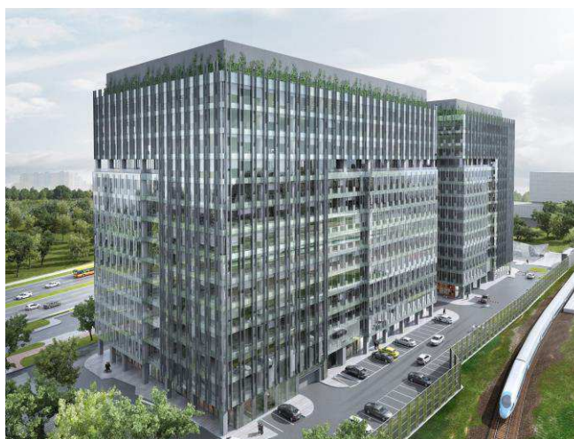
The first building of West Station office complex will be commissioned in Q3 2016 and the second one – in H1 2018

The West Station office complex, located in the direct vicinity of the Warszawa Zachodnia railway station, is scheduled for commissioning in Q3 2016. The coffee shop and the car wash are expected to open soon after. The Friends network already has eight successful coffee shops in Warsaw, providing its customers with a range of tasty, quick and, above all, healthy food options. Their newest branch, which will be located on the ground floor of West Station I, will occupy an area of over 60 sq m. Pro Value, an independent commercial real estate valuation and consultancy firm, represented the Friends coffee house in the negotiations. The Carsan car wash has agreed to lease a 130 sq m space on one of the building's underground levels. This will be the business' fourth stationary venue in Warsaw, but it also offers mobile services to clients and corporations.