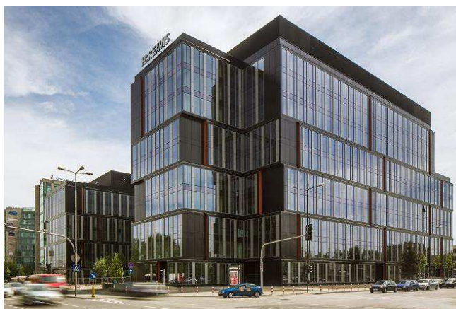
Two months after delivery, 60% of Postępu 14 is commercialized