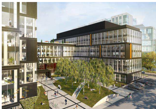
Postępu 14 - the newest HB Reavis project in the Warsaw district of Mokotów