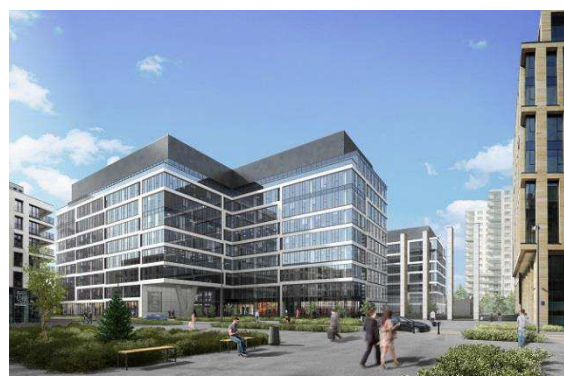
Aviva to move into GBC II in 2016

Under the contract, Aviva will lease 12 500 sq m in Building C, which remains under construction. The building will house the Company's headquarters, currently located in Platinum Business Park IV in the district of Służewiec. Adjacent to its new office space in GBC II, Aviva plans to open a 400 sq m Customer Service Office on the ground floor of Building A, which is part of GBC I and was commissioned in June 2014.