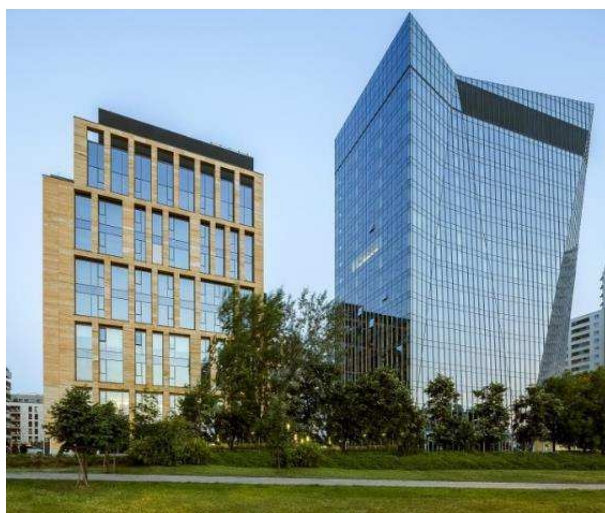
CHBC Polonia will move into GBC I